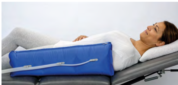
arm sleeve with 3 air chambers full-length zip upper arm circumference up to 60 cm, length 67 cm

Arm and leg sleeves have a full-length zip which facilitates fitting and cleaning. The additional Velcro fastening allows an optimal adjustment to the thigh. The hip sleeve can be changed in size individually.