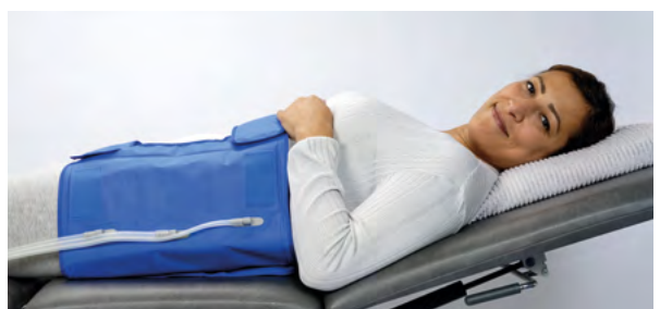
hip sleeve with 6 air chambers variable Velcro fastening on front and rear hip circumference adjustable up to 150 cm, length 38 cm

Home therapy is expedient in the case of increasing need of therapy, chronic syndromes, drug intolerance (e.g. diuretics), or intolerance of permanent compression.