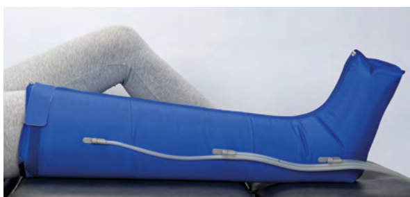
leg sleeve with 3 air chambers full-length zip, Velcro fastening Size M: thigh circumference 70 cm, length 85 cm Size L: thigh circumference 83 cm, length 85 cm