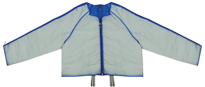
24-chamber jacket complete Art.-Nr. 1180