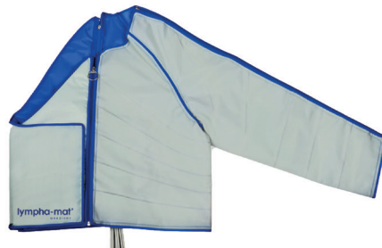
12-chamber left jacket-half with bolero Art.-Nr. 1181