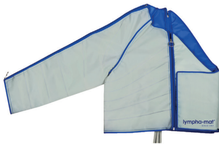
12-chamber right jacket-half with bolero Art.-Nr. 1182

The jacket sleeve is filled with air in a compression cycle in 12 successive steps. This achieves a decreasing pressure gradient. This ensures that the mobilised liquid can disperse freely without reflux.